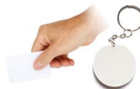
Accessories e.g. transponder card/ keyring pendant