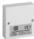
Expansion unit and blocking device CombiXT