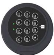
Operating terminal CombiControl CL38 CombiControl RFID